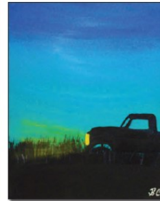
Youth ages 11 - 13 winner Brookelynn Chipelski.