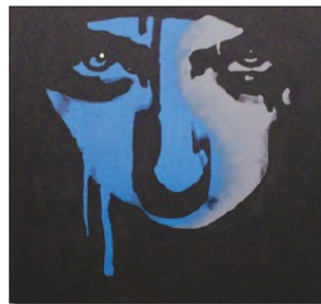
Youth ages 14 - 19 winner Ava Blair.