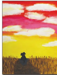
Youth ages 11 - 13 winner Raelynn McNair.