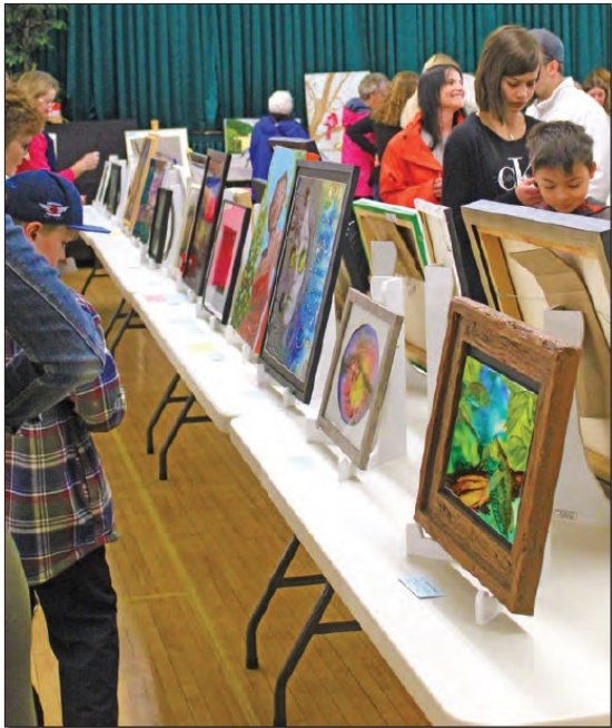
103 pieces of submitted works completed by 61 artists.